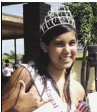
Ms. Kauai Veteran