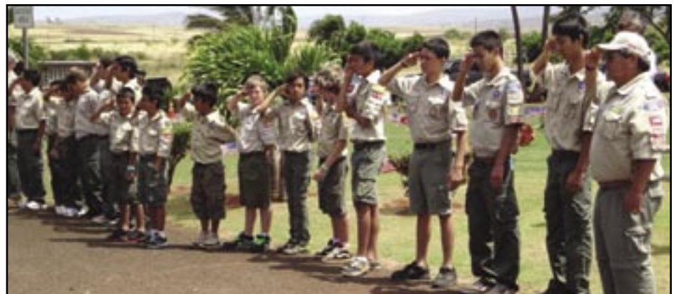
The Kauai Boy Scouts