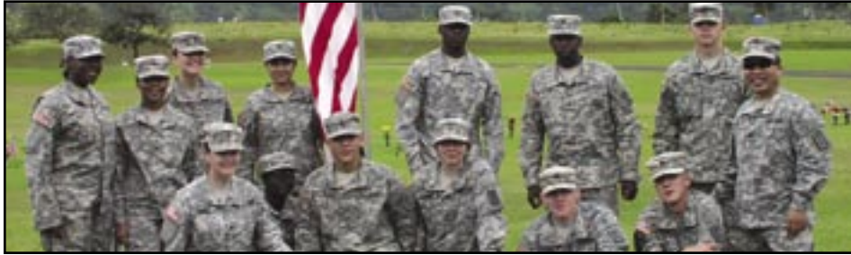
The Military Intelligence Battalion came out on May 29, 2012 with about 15 personnel to assist the HSVC staff remove the flags and artificial leis from the graves.

The volunteers were of great assistance to our Hawaii State Veterans Cemetery staff. Their work in pulling weeds, removing artificial and dead flowers from graves to include clearing the grounds of the cemetery helped in beautifying and readying our veterans final resting place for a day of remembrance at our upcoming Governor's Memorial Day Ceremony.