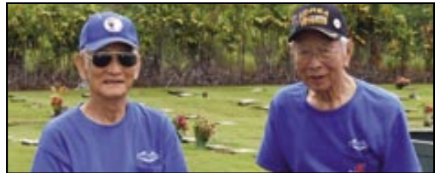
Korean War Veterans cleaning the headstones to prepare for the Memorial Day Ceremony in Hilo.