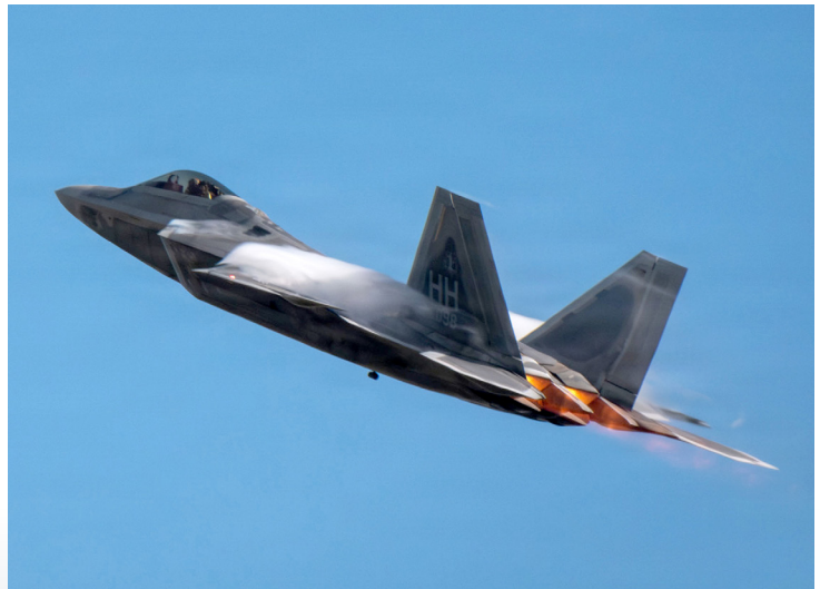
An F-22 Raptor from the 199th Fighter Squadron, Hawai'i Air National Guard took flight during a Sentry Aloha 26-1 at Joint Base Pearl Harbor-Hickam on Jan. 26. Below, Airmen from the 154th Maintenance Group, Hawai'i Air National Guard, conducted a foreign object debris walk before an exercise on Jan. 27.

This iteration of Sentry Aloha brings together more than 40 aircraft to practice core aerial combat capabilities and strengthen the total-force integration between active-duty, Guard, and international partner units.