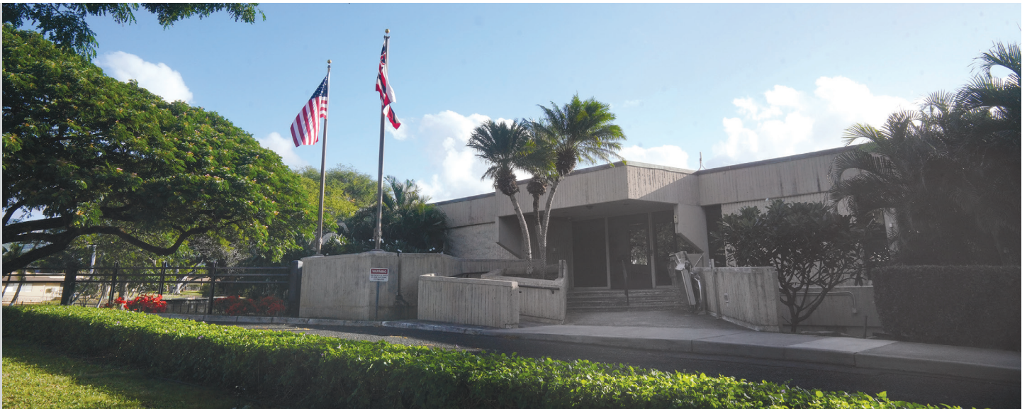
The State of Hawai'i Department of Defense is located at Fort Ruger, Diamond Head.