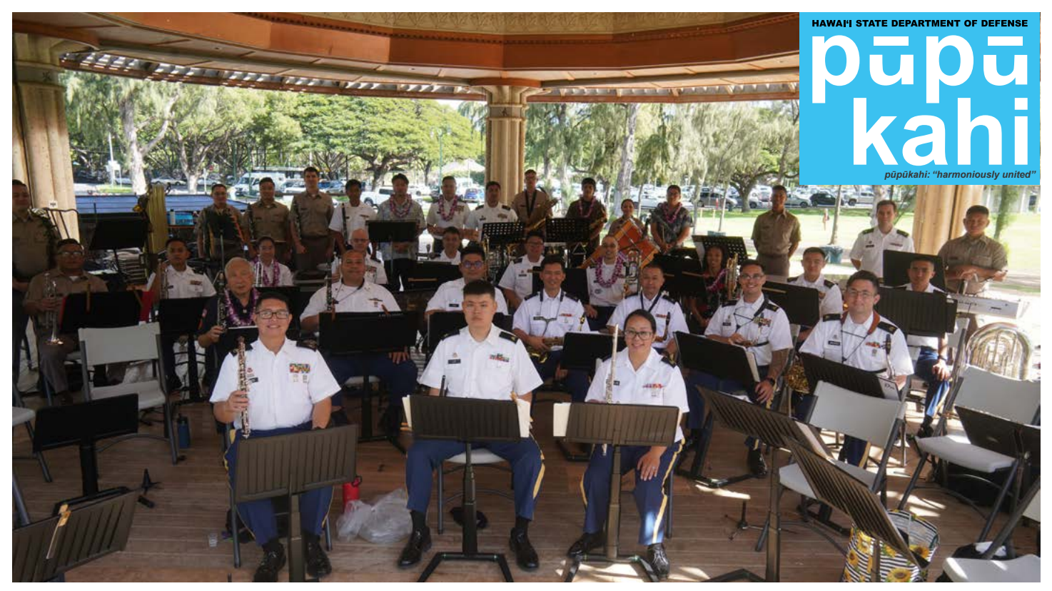
The Hawai'i Department of Defense Office of Veterans' Services celebrated Veterans Day with a concert at the Kapi'olani Park Bandstand on Nov 10. The Hawai'i Army National Guard's 111th Army Band performed musical selections to honor each of the uniformed services.