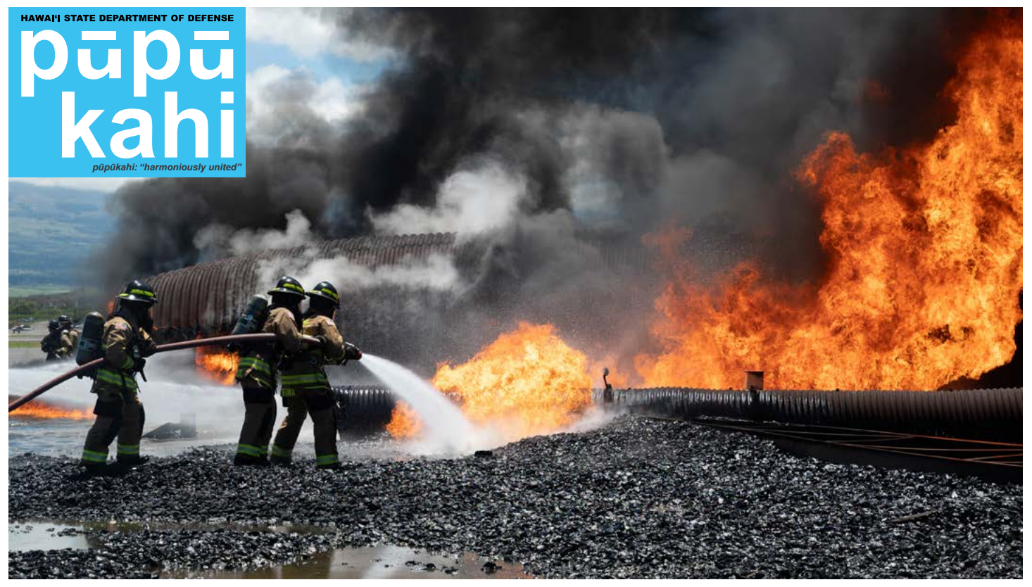
During the month of September, the 297th Engineer Fire & Emergency Services Team, Hawai'i Army National Guard, conducted aircraft rescue firefighting training with the 624th Civil Engineer Squadron, Marine Corp Air Station Kaneohe, Maui County, and State Crash Rescue on Maui. The training simulated a downed cargo aircraft on fire, where firefighters utilized water to increase the number of repetitions in offensive sweeps and suppression. The Fire and Emergency Services team organized 3-man teams consisting of a fire officer, a nozzleman and a back-up firefighter.