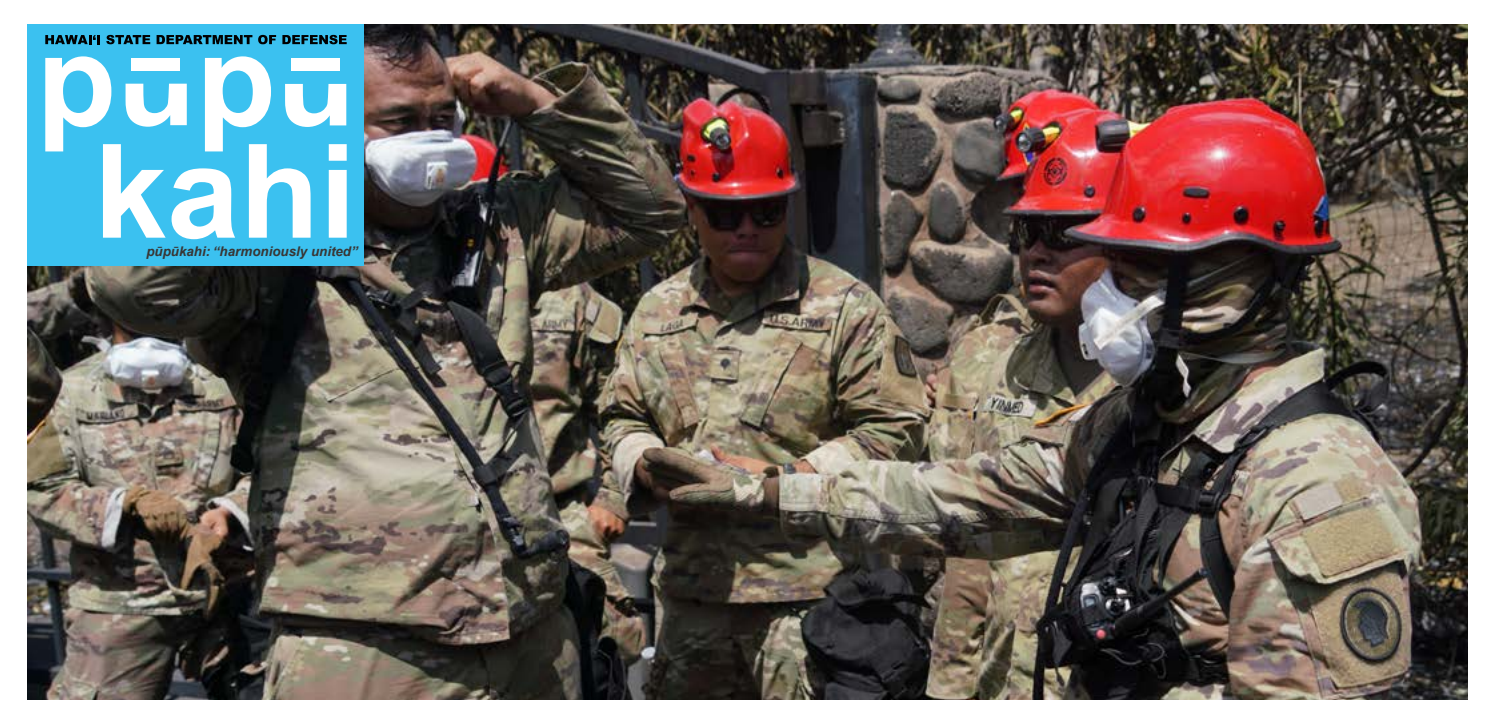
Search and Rescue Soldiers and Airmen attached to Hawai'i National Guard CERF-P unit assist Maui County and State officials in the search and recovery efforts of Lahaina, August 10, 2023. Around 50 Guardsmen were mobilized on Aug. 9 after the wildfire struck Maui and assisted in the sweep of the affected area which will need to be completed before access can be restored to the few unaffected properties.