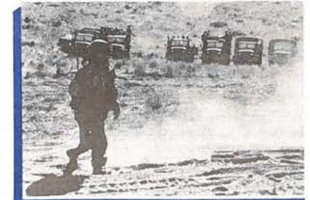
ANG "BEEF", p. 4