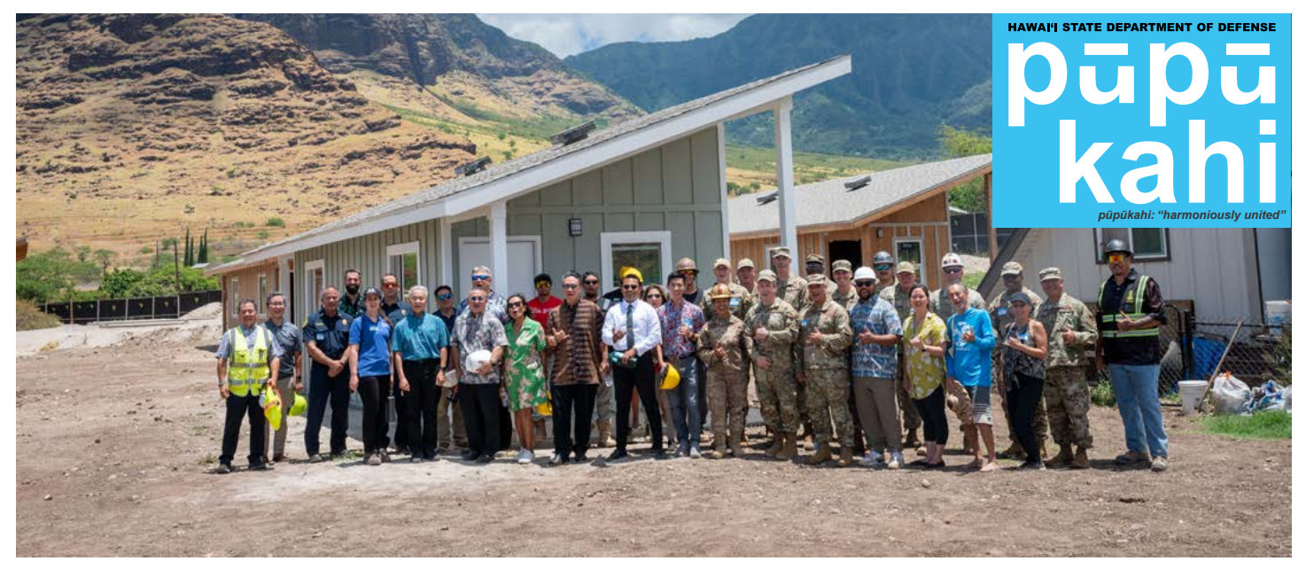
U.S. Air National Guard, Air Force Reserve and community leaders visit the construction site for the Pu'uhonua O' Wai'anae Mauka Village during the 2024 Pu'uhonua o Wai'anae Innovative Readiness Training (IRT) Distinguished Visitors Day in Wai'anae, Hawai'i on Aug. 01, 2024. Pu'uhonua O' Wai'anae Mauka Village IRT is a collaborative program that leverages military contributions and community resources to multiply value and cost savings for participants.