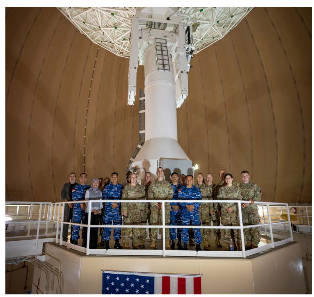
Participants of the Vulcan Guard Bolt-7 Space Subject Matter Expert Exchange receive a tour of the Ka'ena Point Space Force Station during the first Vulcan Guard Bolt-7 Space Subject Matter Expert Exchange on Sept. 16, 2024, at Ka'ena Point, Hawai'i. During the tour, the 21st Space Operations Squadron, Detachment 3, provided a mission brief, followed by an inspection of the Ring Beam Concentrator antenna. This National Guard-led exercise enables partner nations to engage in specialized space training, enhancing their operational readiness in simulated space domain scenarios.