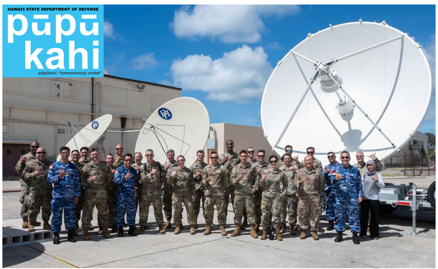
Participants of the Vulcan Guard Bolt-7 Space Subject Matter Expert Exchange receive a tour of the 109th Electromagnetic Warfare Squadron during the first Vulcan Guard Bolt-7 Space Subject Matter Expert Exchange on Sept. 16, 2024, at Joint Base Pearl Harbor-Hickam, Hawai'i. The Hawai'i Air National Guard hosted this multinational event to foster collaboration and enhance space capabilities. Participants explored cutting-edge space defense systems crucial to the protection of both military and civilian assets.