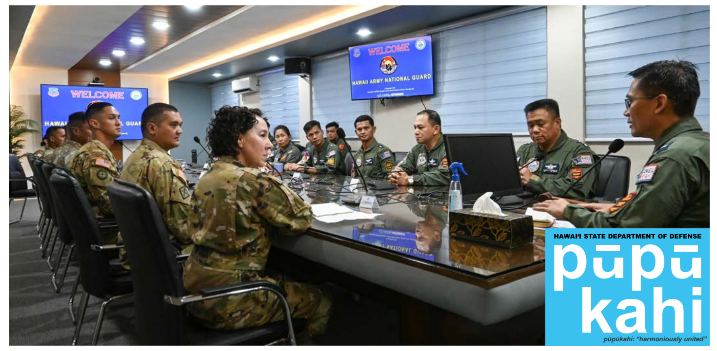
Hawai'i Army National Guard and Philippine Air Force service members meet for the Rotary Wing Aviation Maintenance and Standardization Subject Matter Expert Exchange at Brigadier General Benito N. Ebuen Air Base, Lapu-Lapu City, Philippines Sept. 16, 2024. The Rotary Wing Subject Matter Expert Exchange is a collaboration between HIARNG and PAF, intended to strengthen alliances and partnerships with key allies like the Philippines.