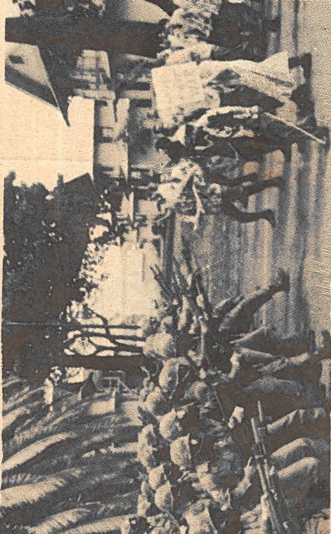
RIOT CONTROL--Members of Troop E, 19th Cavalry are shown during recent riot control training at Schofield Barracks.