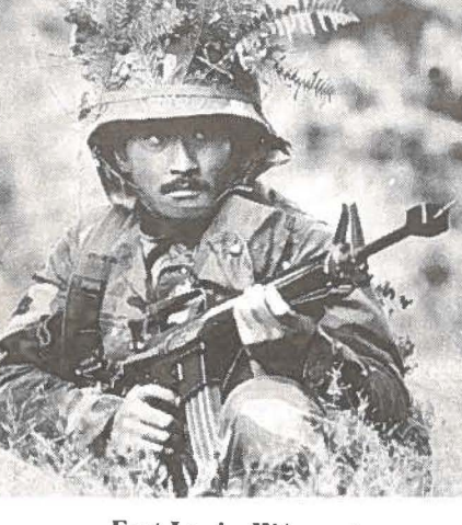
Fort Lewis, WA. p. 4