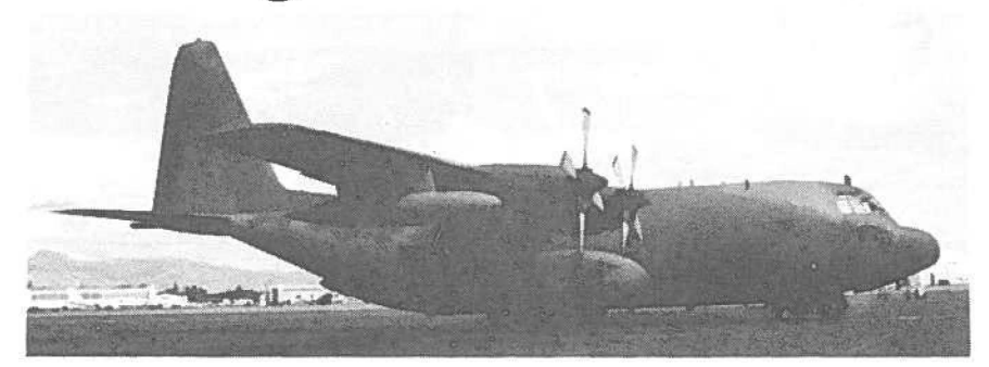
154th Gets its Own—The 154th received its own C-130 on August 25, 1984. The aircraft arrived at Hickam AFB from St. Joseph, Missouri, after making one stop in California