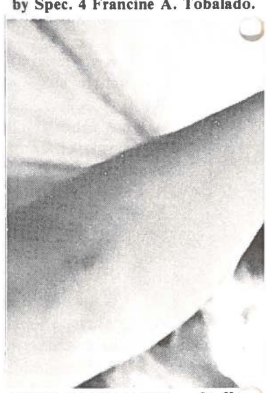
SOME FACE PAINT — Staff Kataoka before moving out into the Company.