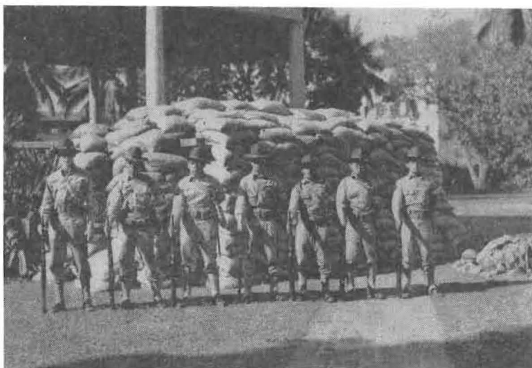
Left to right: Caucasian, Hawaiian, Portuguese, Chinese, Puerto Rican, Korean and Filipino.

In front of Bandstand, Iolani Palace Grounds, Honolulu December 20, 1941