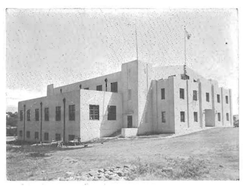
NEW WAILUKU ARMORY, WAILUKU, MAUI Constructed at a cost of $102,632.00. Officially opened on December 4, 1937. (Front view)