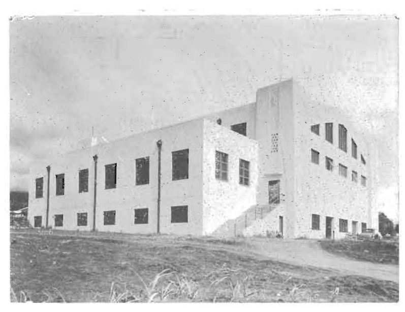
NEW WAILUKU ARMORY, WAILUKU, MAUI Houses following units of 1st Bn., 299th Infantry; Headquarters and Headquarters Company, Companies B and D. (Rear view)