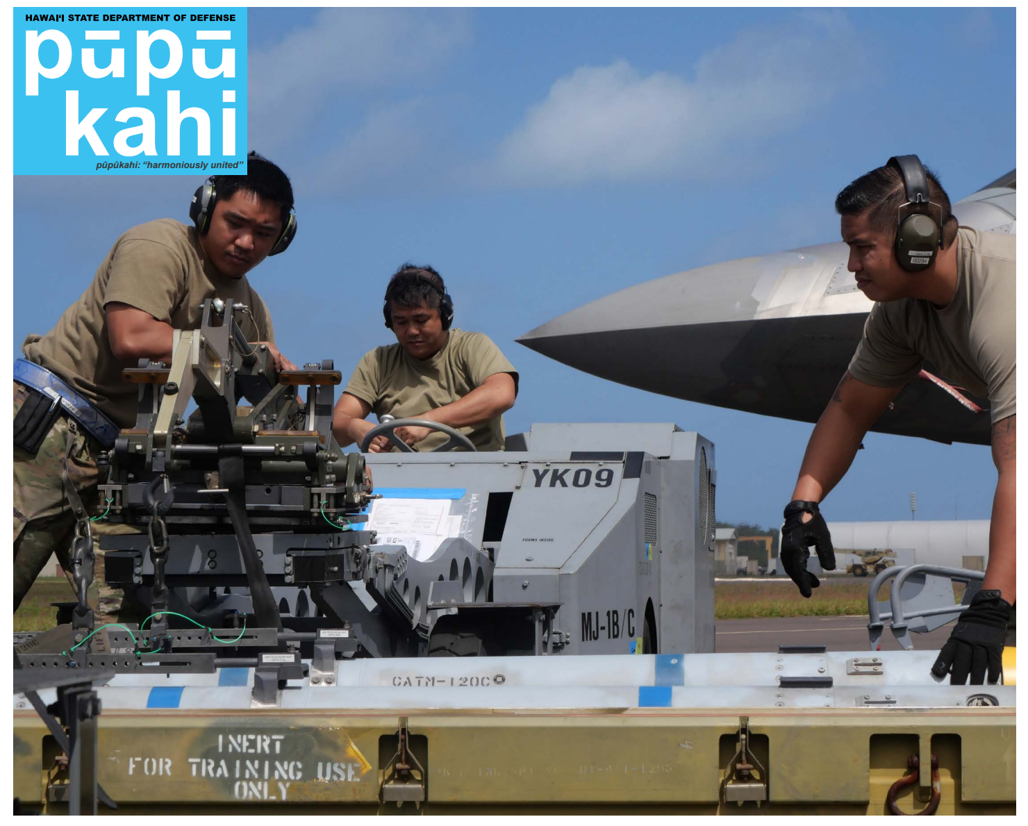
A Hawai'i Air National Guard weapons crew from the 154th Aircraft Maintenance Squadron arms an F-22 Raptor with inert munitions March 8, 2023, at the Pacific Missile Range Facility, Barking Sands, Hawaii. Aircraft armament systems crews from the 154th and 15th Aircraft Maintenance Squadrons were transited to Kauai on a C-17 Globemaster III to help receive, rearm, and launch fighter aircraft within a condensed time window.