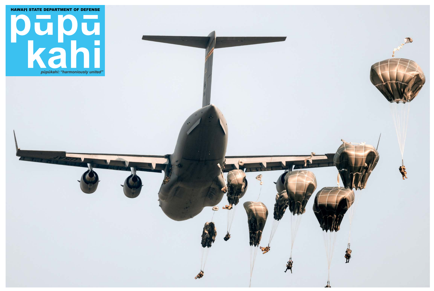
U.S. Army Paratroopers with the 82nd Airborne Division and Royal Thai Army Soldiers conduct a Strategic Airborne Operation during Exercise Cobra Gold 2023, near Thanarat Drop Zone, Kingdom of Thailand, March 2, 2023. Cobra Gold, now in its 42nd year, is a Thai-U.S. co-sponsored training event that builds on the long-standing friendship between the two allied nations and brings together a robust multinational force to promote regional peace and security in support of a free and open Indo-Pacific.