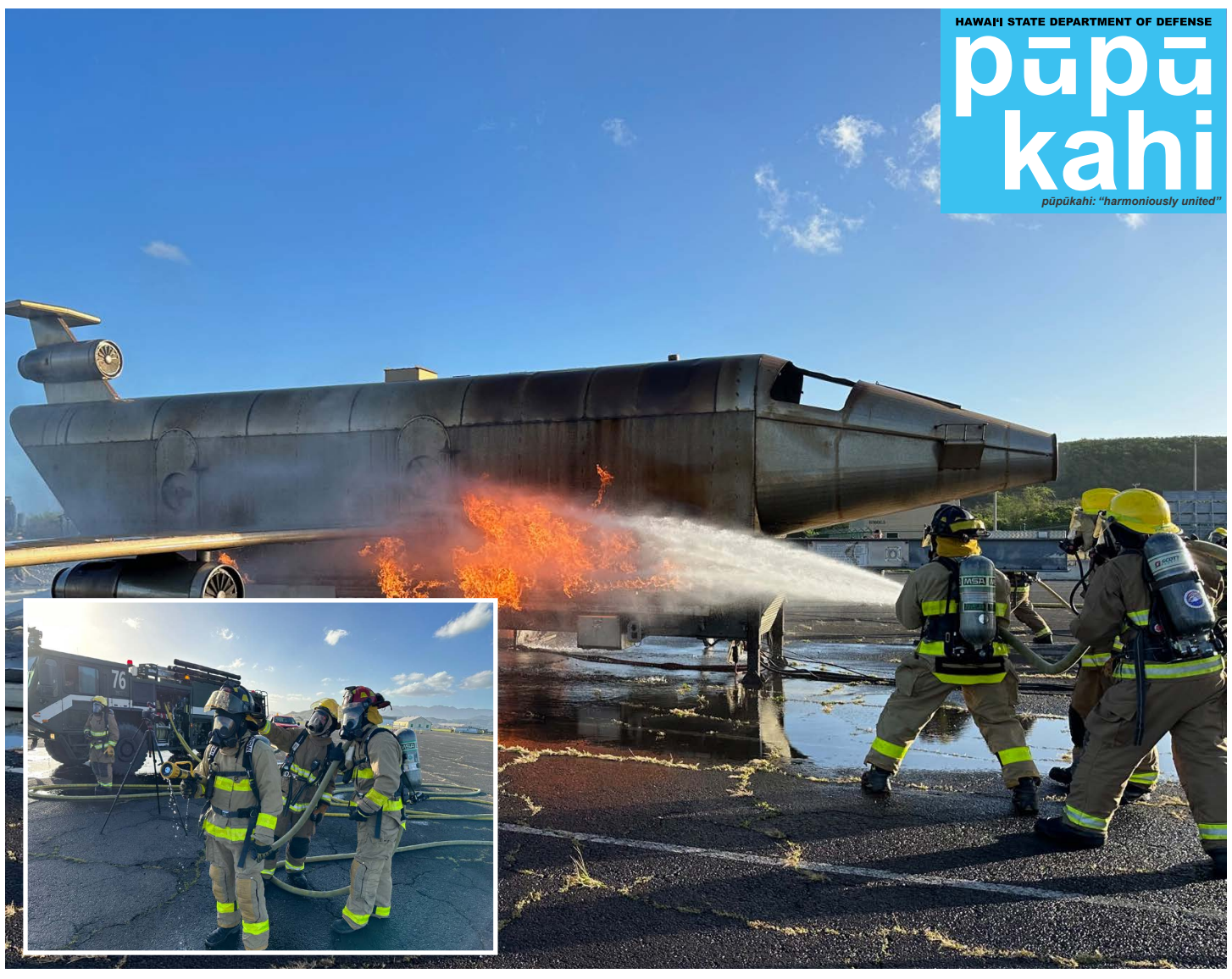
Hawai'i Army National Guard Soldiers assigned to 297th Engineer Firefighting Team, 103rd Troop Command participate in a joint exercise with Air Force Reserves, 624th Civil Engineer Squadron and the Marines Corps, at Marines Corps Air Station Bay, Hawai'i, Feb. 11, 2023. This joint exercise provided training for fire-prevention and protection, aircraft-crash and rescue, natural cover-fire and hazardous material responses within theater operations.