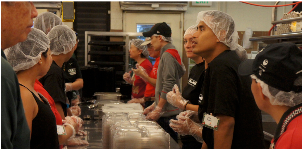
Members of the Hawaii Air National Guard join 200 Lanakila Meals on Wheels volunteers in preparing over 700 meals for home bound elderly on the Island of Oahu Christmas Morning. Lanakila Pacific is a non-profit organization that builds independence for thousands of people living challenged lives.