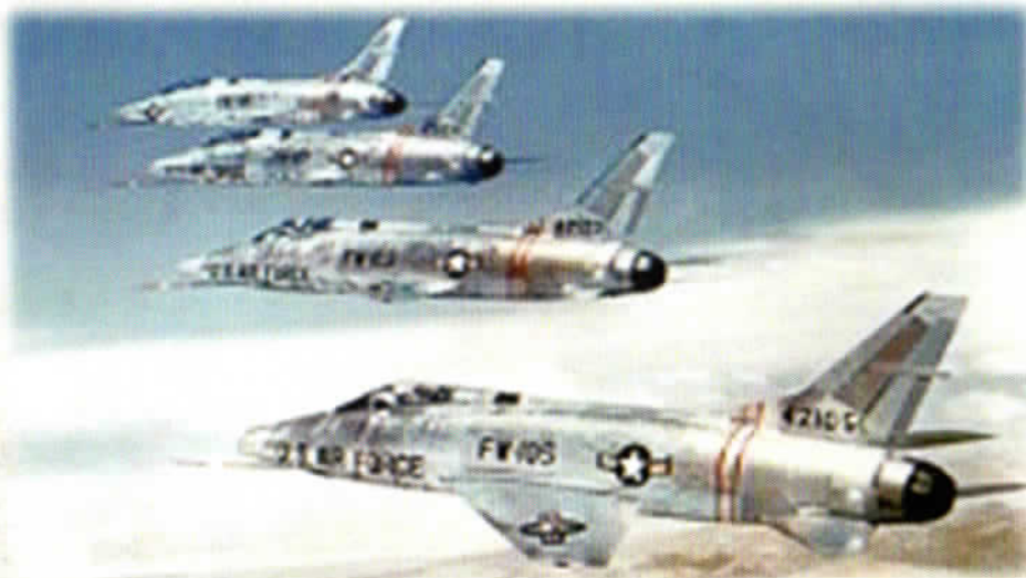
F-100C Super Sabres

The 32-pilot program represented the equivalent of an additional active duty squadron. The program did not hinder the capability of the runway alert forces to perform their day to day mission of air defense.