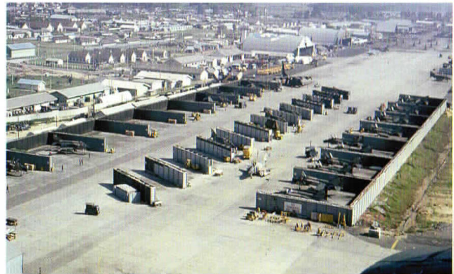
Da Nang, South Vietnam