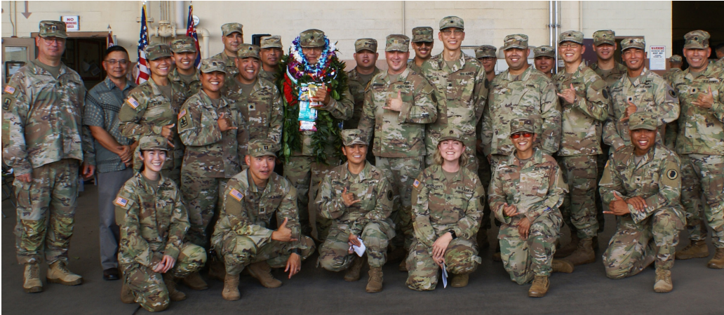
Pictured Hawai'i Army National Guard Medical Readiness Detachment

state transfer to the Hawai'i Army National Guard and returned home. In 2022-23, he deployed again with the Texas Army National Guard with the 36th Combat Aviation Brigade for Joint Task Force Mustang in Syria, Iraq, Jordan, and Kuwait, and served as Senior Field Grade Behavioral Health Officer in Charge of a Combat Aviation Combined Joint Task Force for 1,500 Soldiers from Texas, Maryland, Oklahoma, Arkansas, New York, Puerto Rico, and Hawai'i. Army National Guard units deployed in theater for Operation Inherent Resolve and Operation Spartan.