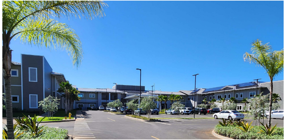
The Daniel K. Akaka State Veterans Home is located in Kapolei, O'ahu.

Veterans who served on active duty for at least one day may qualify for residency. Our team is happy to guide veterans and their families