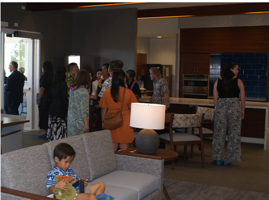
The common living room-dining and shared kitchen areas at the Daniel K. Akaka State Veterans Home.

It is our honor to care for those who have served.