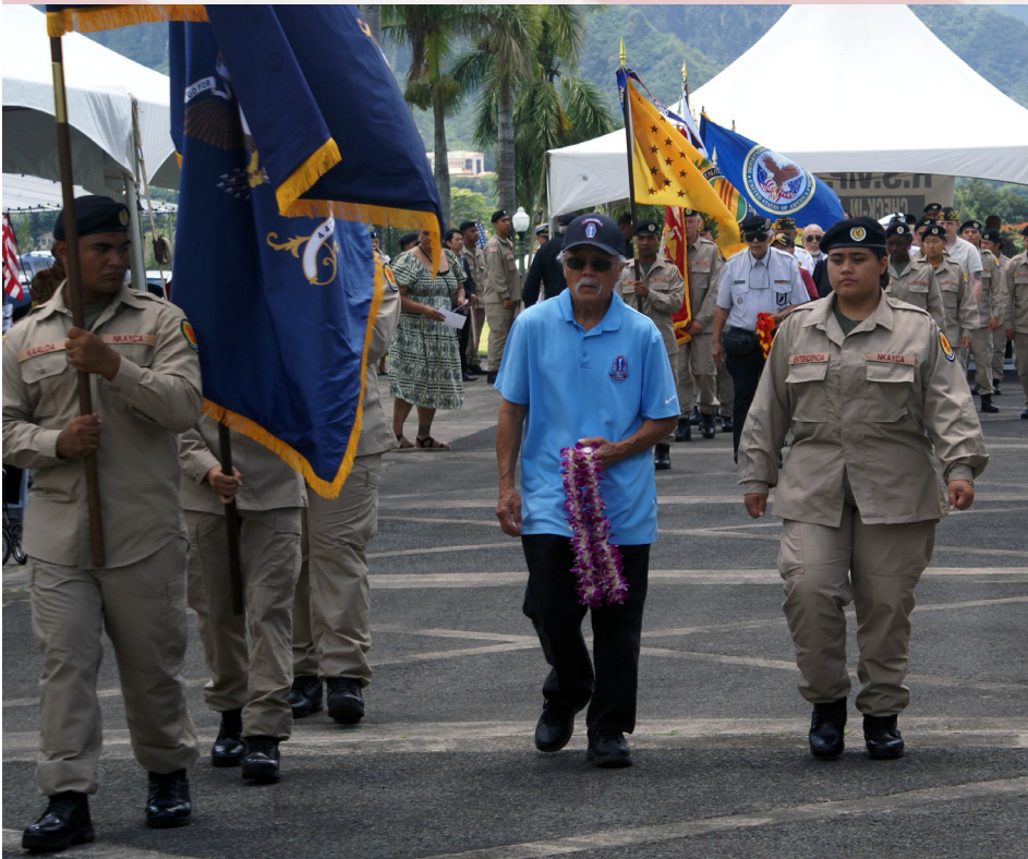
Veterans participating in the Governor’s Memorial Day Ceremony carrying flags and lei.