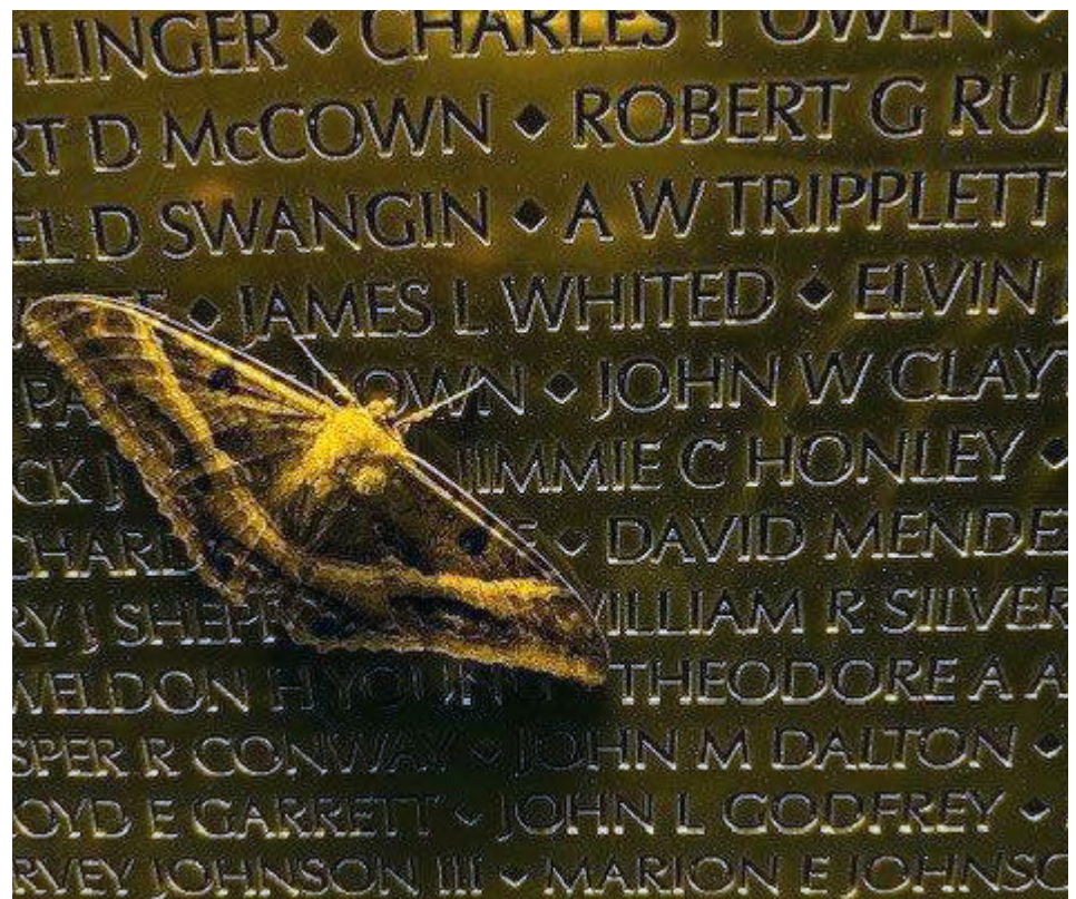
A moth came to visit the TWTH exhibit on Maui.