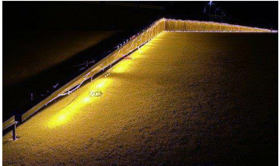
Overhead night view of the TWTH exhibit in Maui last January.

The Wall is open 24 hours a day from 2 pm on Tuesday until 2 pm on Sunday.