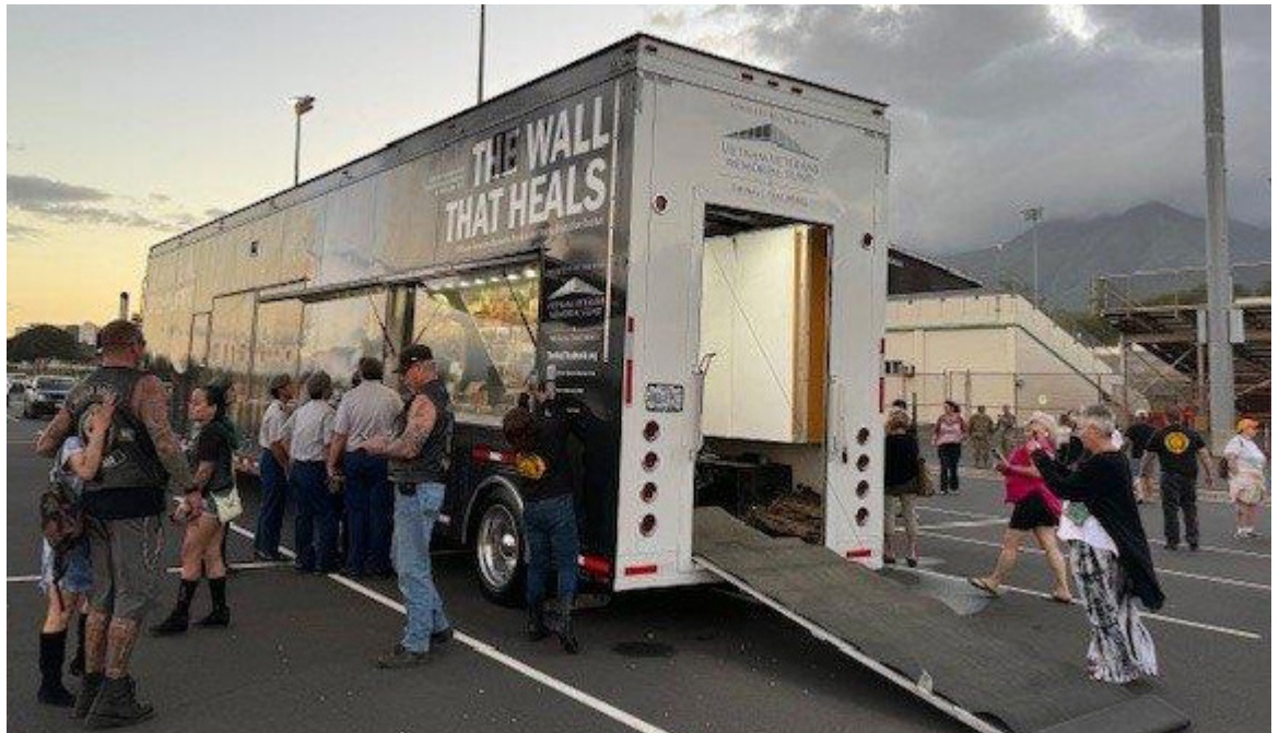
Volunteers are unloading the trailer and cleaning the windows for the TWTH exhibit.

For volunteer opportunities, visit www.TheWallThatHealsOahu2026.org or contact organizers at twthoahu2026@gmail.com .