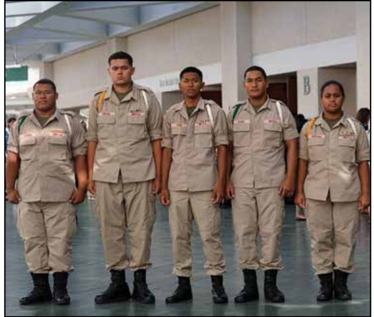
Hawaii National Guard Youth Challenge Academy conducts presenting of colors, offers support, for the 2019 Hawaii Veterans Summit.