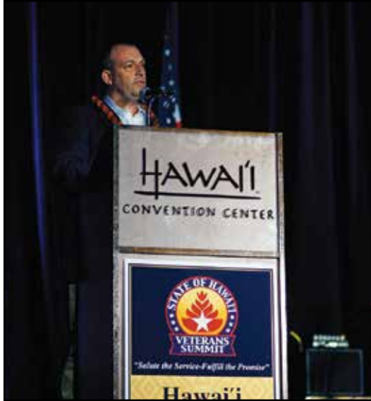
Lt. Gov. Josh Green addresses veterans at 2019 Hawaii Veterans Summit, professing support for those that have served their country.