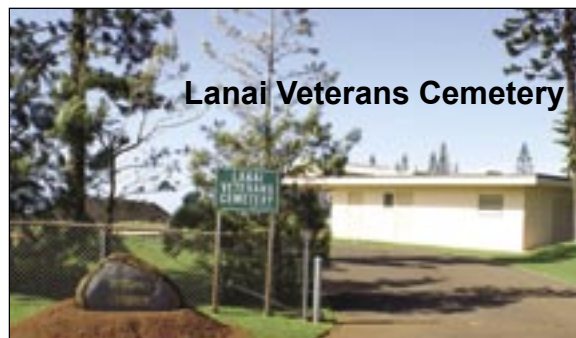
Lanai Veterans Cemetery