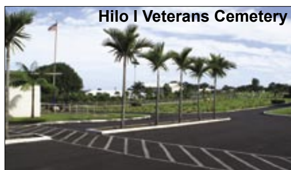
Hilo I Veterans Cemetery