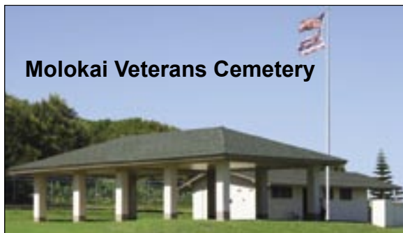
Molokai Veterans Cemetery