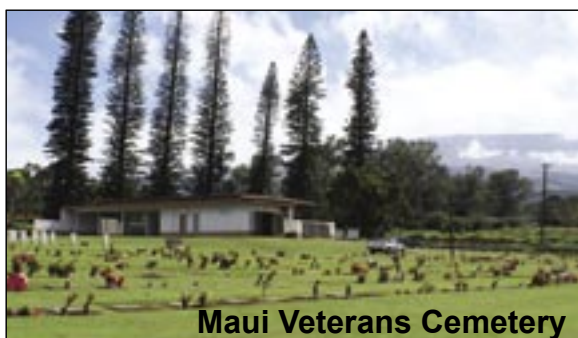
Maui Veterans Cemetery