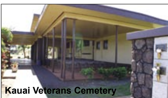
Kauai Veterans Cemetery