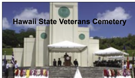
Hawaii State Veterans Cemetery