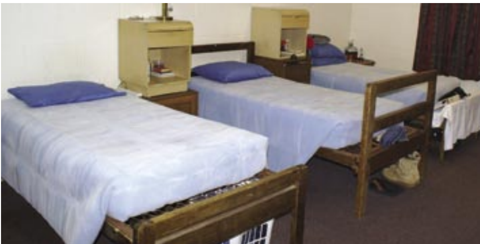
The U.S. VETS-Hawaii facility at Kalaeloa. The program offers two three-story buildings that consists of 106 beds.

Data from U.S. VETS-Hawaii showed a recent study conducted in Hawaii on Jan. 25, 2011. The study revealed that on any given night 505 veterans are without permanent housing in Hawaii. The aforesaid number includes 295 still living unsheltered. As of May 27, 2011, we have 3 years, 5 months, and 7 days to provided for the housing and support needs of these veterans to meet Sec. Shinseki's dept. goals. U.S. VETS-Hawaii's plan is to make it happen! U.S. VETS-Hawaii is committed to playing its part and doing its role to end homelessness among veterans.