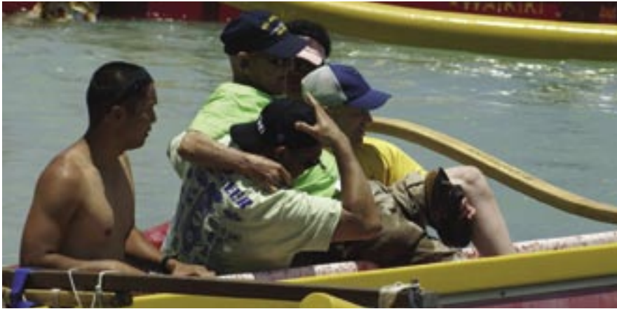
Volunteers show veterans the “aloha spirit.” Surf and canoe clubs gave a few lucky veterans a ride around the ocean in outrigger canoes.

The National Veterans Golden Age Games “Patriots in Paradise” were held on May 26-31, 2011 in Honolulu. The Games celebrated their 25th year offering sports and recreational competitive events for veterans 55 years and older. The Dept. of Veterans Affairs (VA), Veterans Canteen Service (VCS) and Help Hospitalized Veterans (HHV) all co-sponsor the National Veterans Golden Age Games each year.