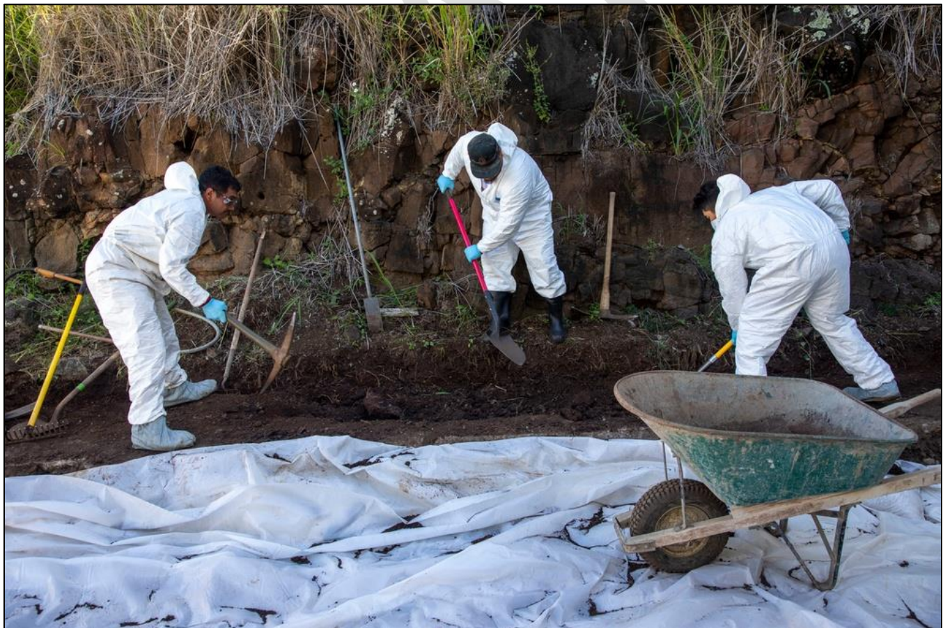
Figure 4.7-3. Naval Employees Relocate Soil Contaminated by Aqueous Film Forming Foam (AFFF) Concentrate in 2022

Source: (US DOT Pipeline and Hazardous Materials Safety Administration 2022, U.S. Environmental Protection Agency 2022, Jedra 2022, McCullough 2022)