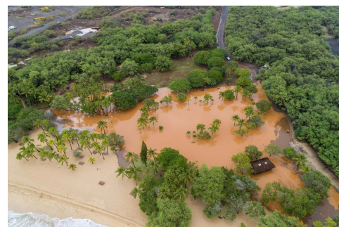
Kona Low Flooding.