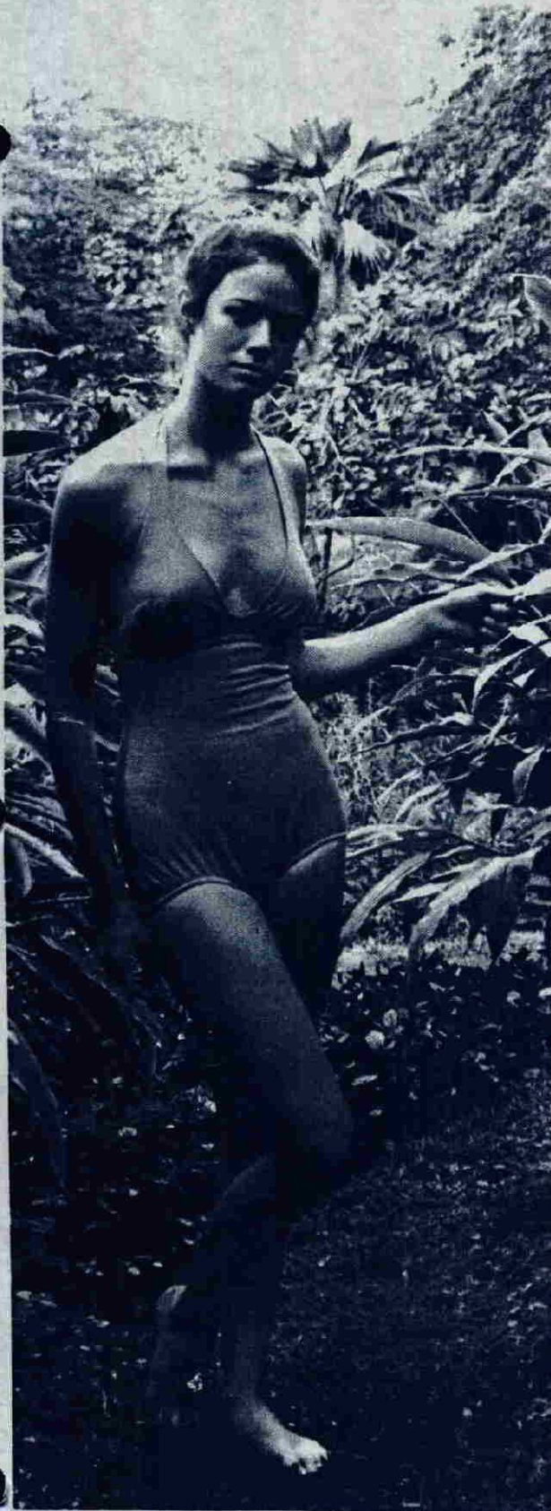
MISS DECEMBER'S CHRISTMAS WILL BE GREEN...