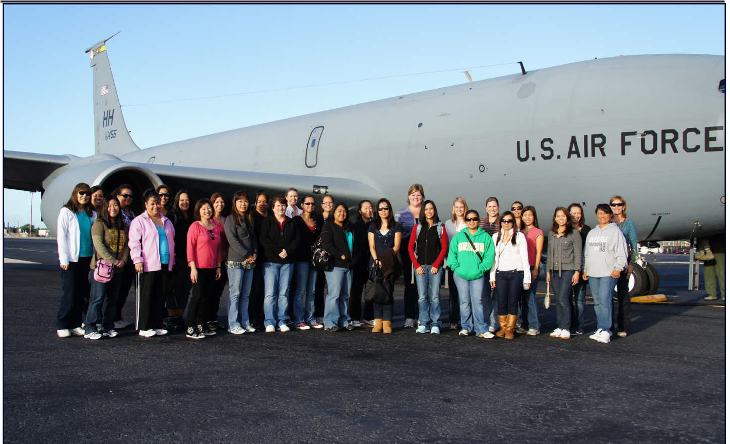
ALL ABOARD- Spouses of Hawaii Air National Guard members pose for a photo before climbing aboard a KC-135 Stratotanker for an orientation flight, Jan. 8, 2012 at Joint Base Pearl Harbor-Hickam. The brief flight gave them an overview of what their significant others do while away from home on drill weekend.