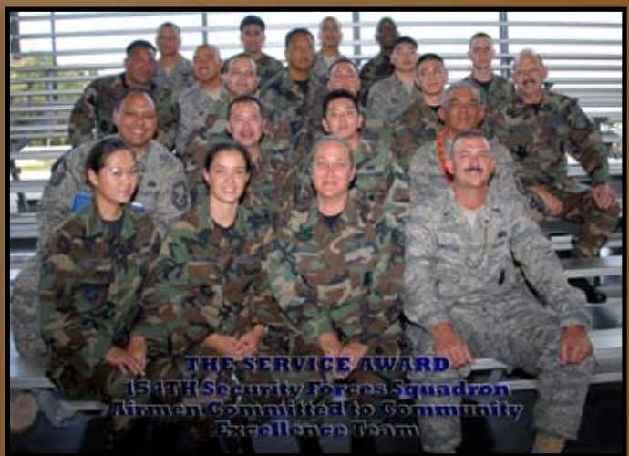
THE SERVICE AWARD 154TH Security Forces Squadron Airmen Committed to Community Excellence Team