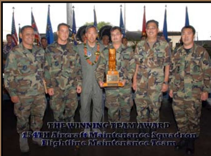
THE WINNING TEAM AWARD 154TH Aircraft Maintenance Squadron Flightline Maintenance Team