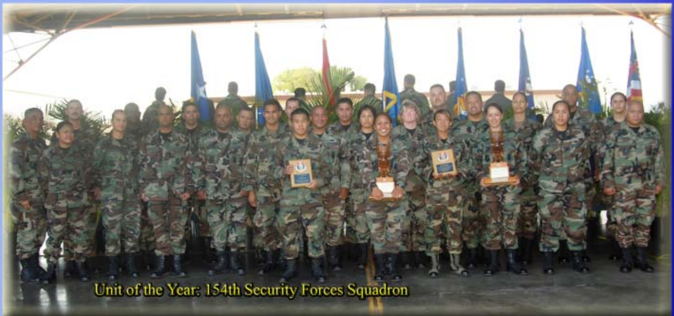
Unit of the Year: 154th Security Forces Squadron