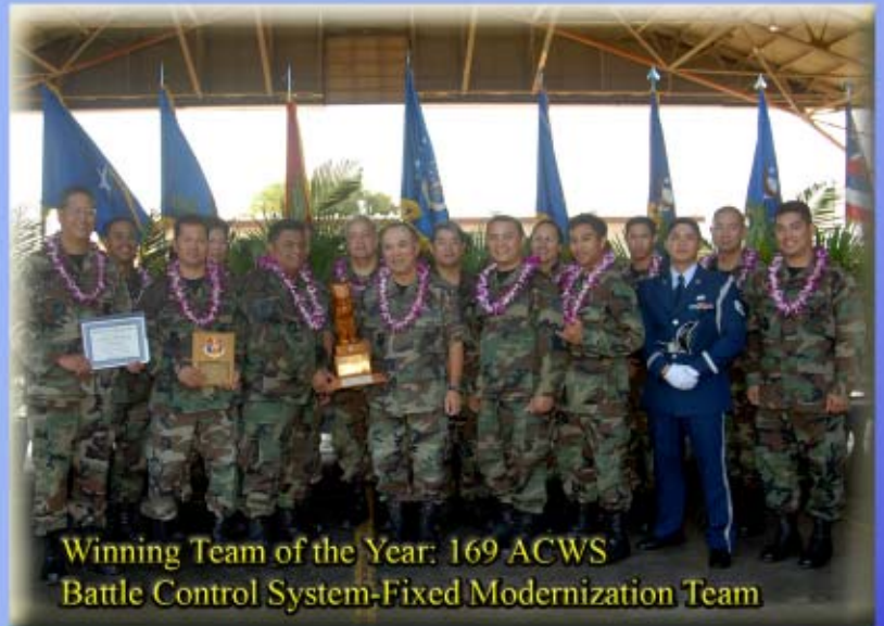
Winning Team of the Year: 169 ACWS Battle Control System-Fixed Modernization Team