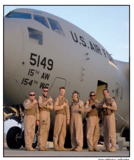
Guard/Active crew in Afghanistan.

Two days after departing Hickam, the C-17 crews arrived at Diego Garcia where they began flying missions in and out of Afghanistan. The flight routes took them just west of Indian airspace and other Southewest Asia areas. Even though the crews only flew one mission a day into Afghanistan, each mission