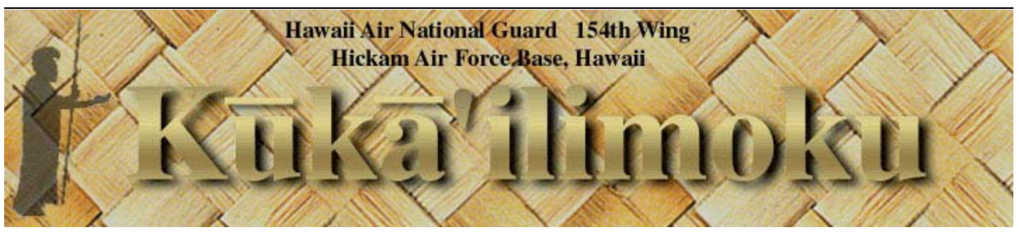
Vol. 53 No. 8