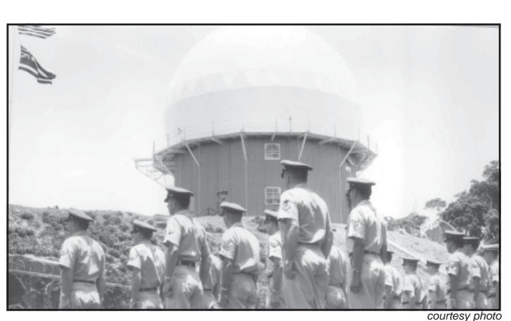
Members in formation at Kokee Air Force Station facility June 1964. Air defense operations at Kokee Air Force Station started in March 1961 as Detachment 1 of the 109th Aircraft Control and Warning Squadron, Punamano Air Force Station, Oahu.

question as to whether or not the HIANG is the best unit for the job. Thank you to all the past and present members who have spent their HIANG years support-