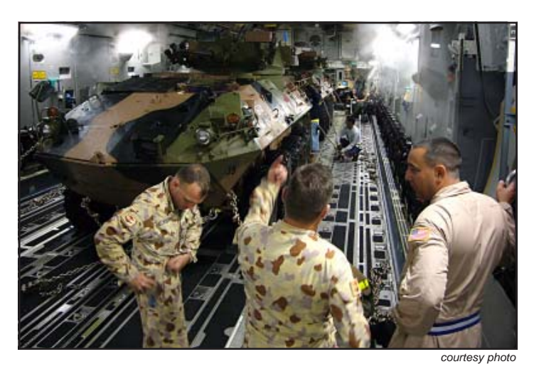
Combined Guard/Active Duty aircrews from Hickam Air Force Base picked up Australian troops and equipment on their way to Afghanistan.

For the dirt field operations, or SPRO (Semi Prepared Runway Operations), it was a real learning experience. The active duty counterparts had already flown into similar dirt strips in the C-17, but this was a first for the Guard crewmembers and a great learning experience!