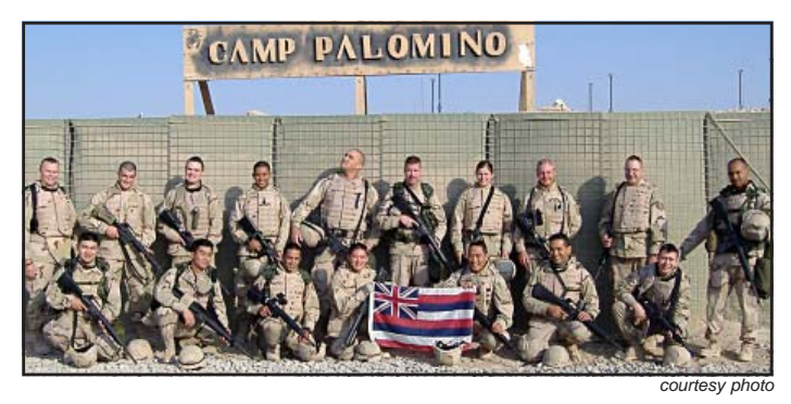
Members of the 293rd Combat Communications Squadron at Camp Palomino, Kandahar Airfield, Afghanistan.

The Airmen hailing from the 291 CBCS, 292 CBCS, 293 CBCS, 297th Air Traffic Control Squadron and