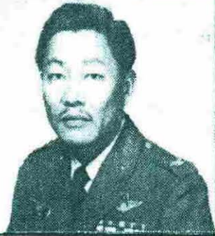
by Col. John S.W. Lee

Perhaps you've read about the Gramm Rudman-Hollings Act and how it's affecting our nation, national defense and the world economy. Well it has finally reached the Hawaii Air National Guard with considerable impact. In plain language, we will cut our budget beginning in April and for a total of six months by about $1,000,000. In our operations and maintenance allocation, significant reductions were projected in the following areas: