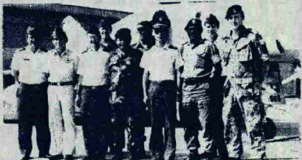
Officers from Australia, Brunei, Fiji, Japan, Malaysia, Tonga, and Vanuatu toured the HI-ROCC facility on November 5 and 6. The visit was in concert with an on-going Oppor-tune Journey exercise. The same officers were given a tour of the 154 Composite Group facility and aircraft on November 8.