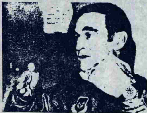
The chief of staff reviews flying maneuvers prior to an operational flight while he was USAFE commander-in-chief.

Even though we've been flying more and doing it more aggressively, our safety record is the best in history. Last year I told you of our unbelievably low record-setting 2.33 rate in '82 - 1983's record was 1.73 accidents per 100,000 hours of flying -- realistic training, not just boring holes in the sky. To date, our 1984 record is about the same as last year's. Many of you have helped us achieve this outstanding record. You are the ones designing and building our airplanes with safety, reliability and maintainability in mind.