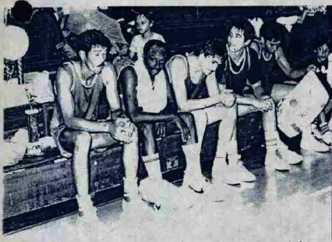
154th Relaxes on their VICTORY!..