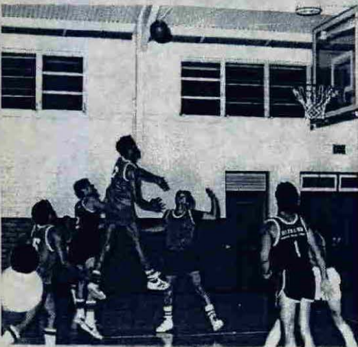
I Got it! I Got it???