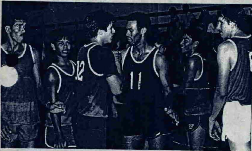
"Really" Thanks for the GAME!..