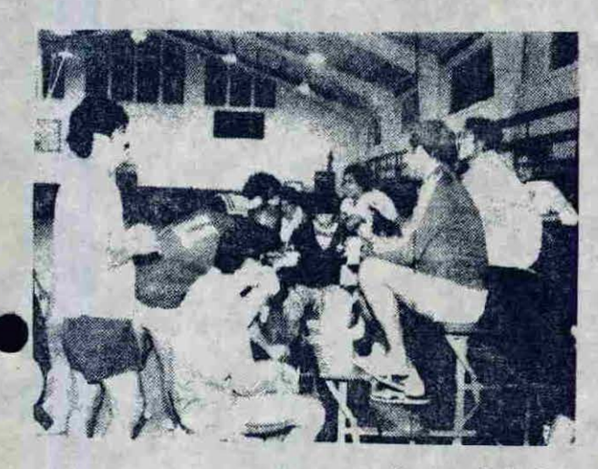
Okay! Halftime over, Lets' play ball!