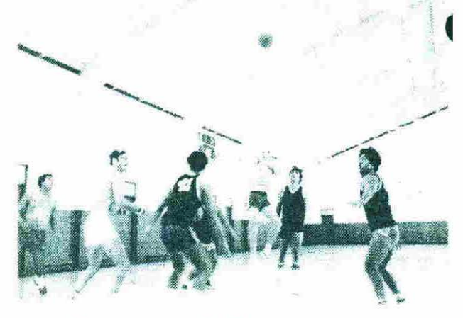
Here it goes fellas...