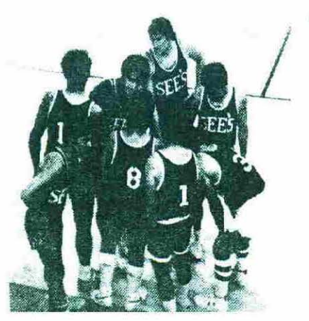
"Okay, let's go get 'em, Gang!"