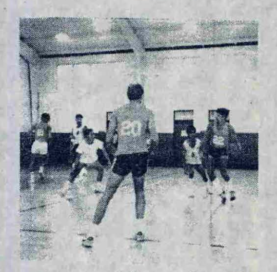
154th COMPG "B" with 169th ACW