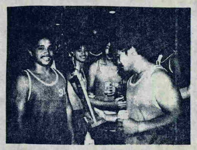
'EH Boys' see what we won!