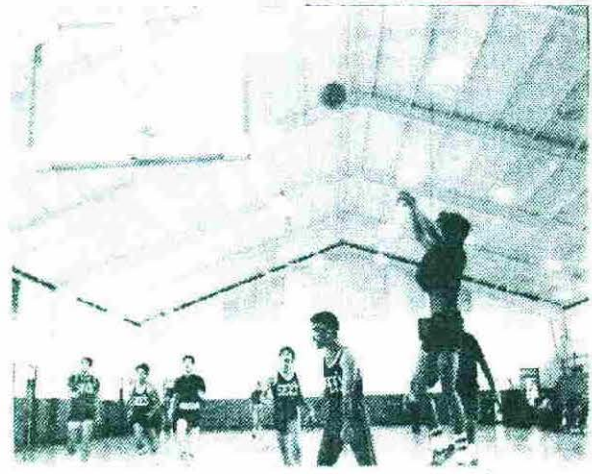
"Eh, Ref...He wen' step outside!"