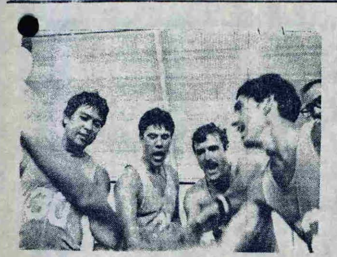
154th COMPG "B" Battle Cry.