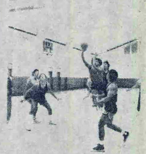
Shoot 'EM Brah! .. I get 'EM ...