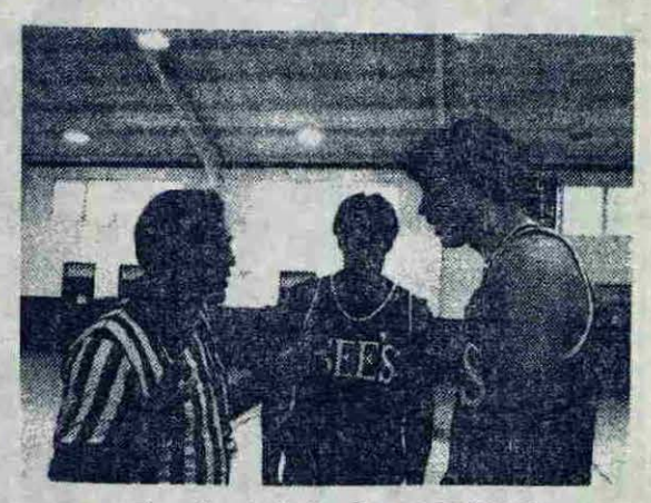
That's it! You're THROUGH!