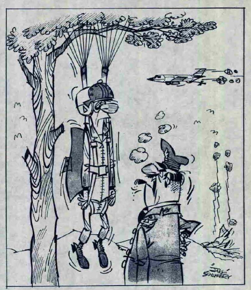
"Yes, it is customary to cut your switch when gassing your car, however, Lt Ripcord, when refueling your plane---!"