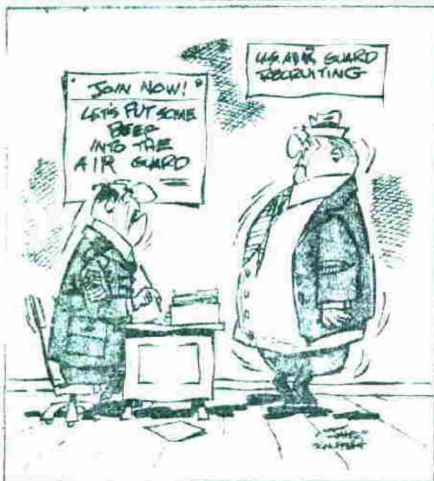
"Sorry, Murdock, yours is not the kind of BEEF we have in mind."

For more precise conversion 1 liter = .2642 gallons 1 gallon = 3.785 liters