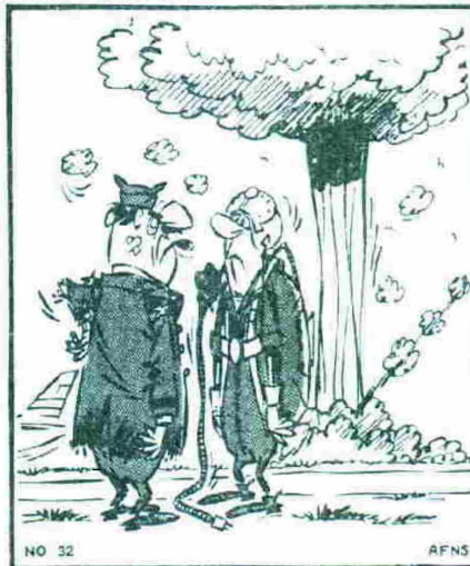
"OK RETGEN, I'LL TAKE YOUR WORD THAT YOU ACCIDENTLY DROPPED THAT BOMB ON HQ. IF YOU PROMISE IT WILL NEVER HAPPEN AGAIN."