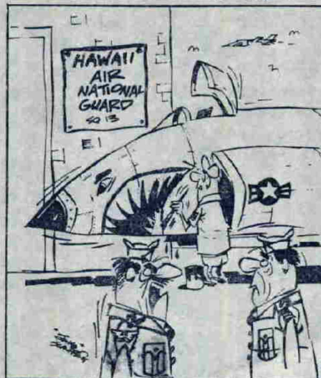
"WHEN I TOLD YOU TO PUT SOME TEETH INTO OUR OPERATION, THAT'S NOT WHAT I HAD IN MIND."