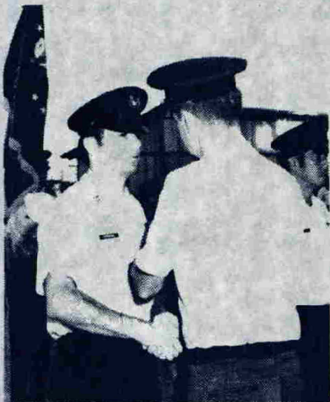
Clockwise from L are:

154TH WING HISTORY OFFICE FILE # 2-98.743