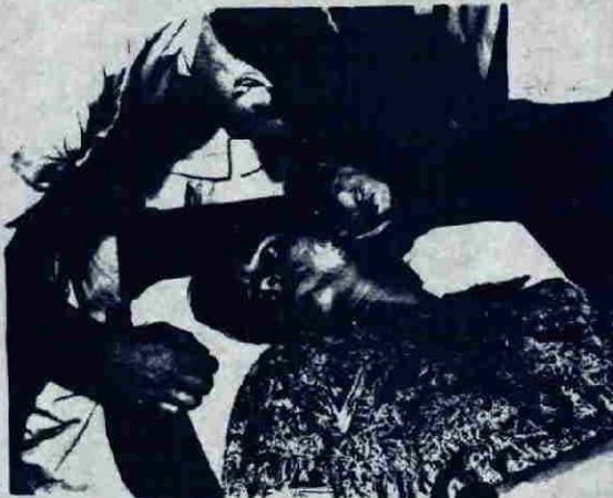
WHEN DISASTER STRIKES--MEMBERS OF THE 154TH USAF DISPENSARY PLAYED A GRISLY ROLE DURING THE JUNE DISASTER PREPAREDNESS EXERCISE, USING REALISTIC MAKE-UP TO SIMULATE INJURIES.

Again, we ask that every member report accidents as soon as they occur...there is apparently not enough importance connected with the timeliness of these reports to Safety.