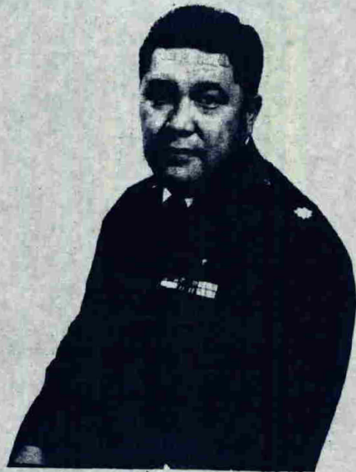
LT. COL. NAGAI NEW FIS COMMANDER

WHILE THE ORIGINAL FY 73-74 UTA PLAN CALLED FOR TWO SUNDAY DRILLS IN OCTOBER, IT HAS BEEN DEEMED NECESSARY TO HOLD A SINGLE FULL WEEK-END DRILL ON OCTOBER 13 AND 14. COL. ASHFORD INDICATED HIS INTENT TO PROCEED WITH THE EXPERIMENT LATER IN THE YEAR. HOWEVER, DUE TO THE LONG WEEK-END SITUATION IN OCTOBER, HE FOUND IT NECESSARY TO HOLD THE SINGLE DRILL IN ORDER TO ACCOMPLISH THE GROUP MISSION.