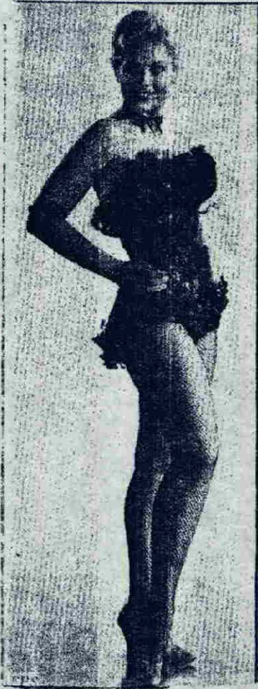
....It's Kim Novak, modeling the latest in string neckties. *****

March 6 to April 6 of this year should have some special significance to all of us. It's time to start thinking of those Easter Seals.