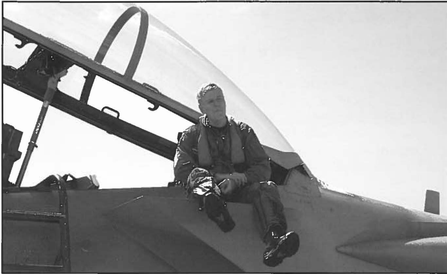
Retired Chairman of the Joint Chiefs of Staff, General Richard B. Myers speaks to Hawaii Air National Guard members following his final flight here Oct. 20, 2005. General Myers was the PACAF commander in 1998. During his tour as PACAF commander, he flew missions with the HIANG'S 199th Fighter Squadron.