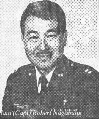
By Chaplain (Capt) Robert Nagamine

I believe that the Middle East peace conference in Madrid, Spain between Israel and the Arab nations is a positive step in acquiring peace. Of course, most people think that peace in the Middle East is impossible. They have good reason to feel this way. The Israelis and Arabs are very much religiously and philosophically different, especially when you consider the radical wings in the two groups. But at the same time, if both sides don't dialogue, both sides will continue to be in a losing situation and peace will never become a reality. Even with all of the doubts and skepticism of peace, they should and must strive for peace. People's lives are actually at stake here. Without peace, clashes and terrorism will continue to happen, even to innocent people.