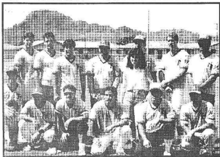
Winners of the 1989 HIANG State Softball Tournament 154 CAM (A).