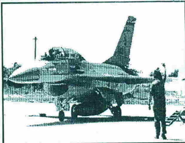
Crewchief from the 162nd TFG, recovers his F-16 after a grueling mission with the 199 TFS.

Pay checks for the June 10-11, 1989 UTA should be dated June 23, 1989.