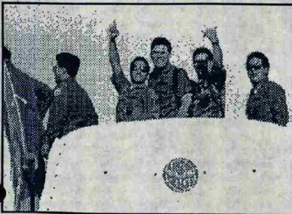
Excited HIANG members waving "Shaka" to the family and friends as they board the KC-10 on their way to the Philippines.

This deployment was the first 154th deployment in the F-15 aircraft and through sheer hard work, dedication and professional zeal all eight F-15s and 125 personnel reported home safely and a little wiser than when they left.