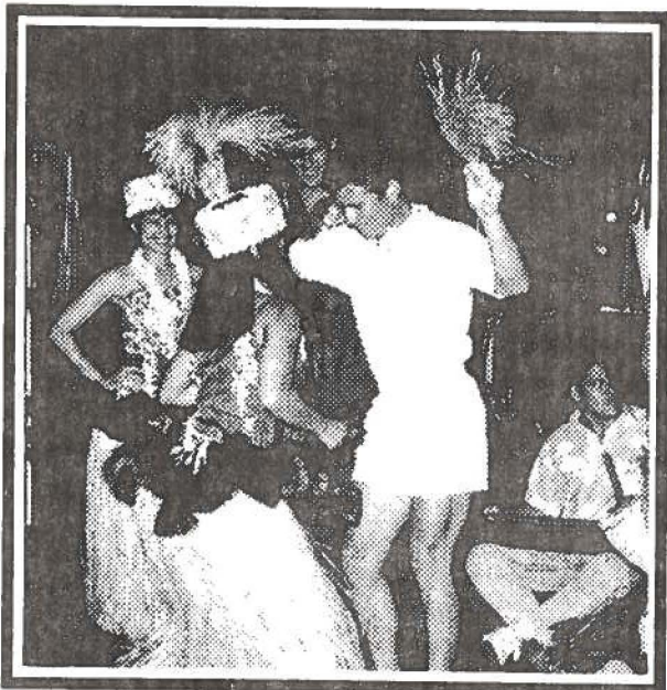
A member of the 125th FIG shows his moves at the Sentry Aloha Luau.

The training involved basic 1v1 fights, advanced 2v2 and 4v4 fights, and complex multi-aircraft scenarios. With these rigorous exercises, the pilots, GCI controllers and maintenance people become better skilled in serving the Hawaii Air National Guard and its mission.