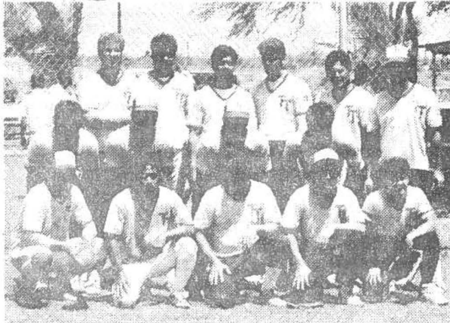
154TH CAM "A" TONY TIGERS