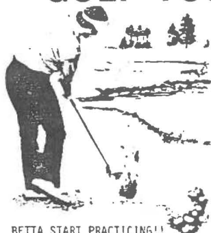
BETTA START PRACTICING!!