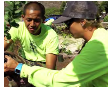
Hawaii Army National Guard Hosts Clean-up Project at Diamond Head State Park - Read more:

After the governor expressed concerns about funding the National Guard, the Secretary of Veterans Affairs Eric Shinseki strongly emphasized the need to address a problem we have... Read More