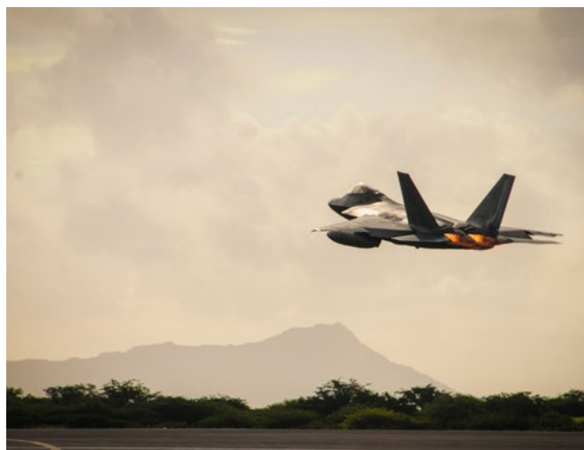
A Hawaii Air National Guard F-22 Raptor takes off from Joint Base Pearl Harbor-Hickam, Sept. 26, 2015. The Hawaiian Raptors are deploying to the CENTCOM area of responsibility. This is the first combat deployment for the 199th Fighter Squadron since it deployed to Saudi Arabia in 2000 to patrol the southern no-fly zone of Iraq.

While some of the Hawaiian Raptors are deployed, the HIANG will continue to perform its 24 hour a day/365 days per year air defense mission, as some of the F-22s have remained in Hawaii.