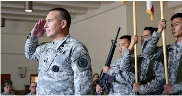
Lt. Col. Courtney Vares-Lum salutes the official party during the 103rd Troop Command change of command at the Hawaii Army National Guard armory Oct. 4, 2015. Vares-Lum acted as commander of troops for the ceremony.