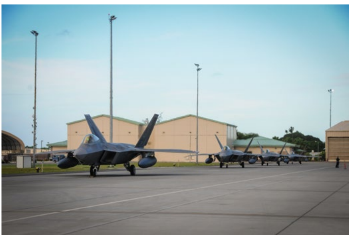
The Hawaii Air National Guard F-22 Raptors taxi through the tarmac at Joint Base Pearl Harbor-Hickam, Sept. 26, 2015. The Hawaiian Raptors are flown by pilots from the HIANG's 199th Fighter Squadron and the active duty's 19th Fighter Squadron. Maintenance and other support personnel are from the HIANG's 154th Wing and the active duty's 15th Wing. The Hawaiian Raptors are deploying to the CENTCOM area of responsibility.