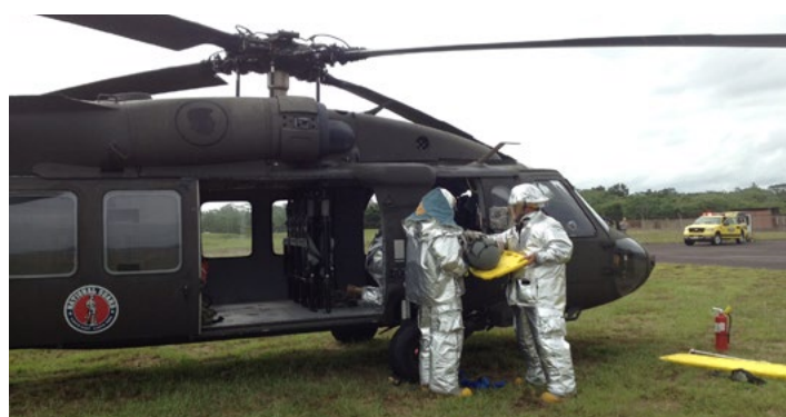
The Hawaii Army National Guard AASF #1 in Hilo conducted its annual pre-accident plan rehearsal with the Hilo Aircraft Rescue and Firefighting team at Hilo Airport September 22, 2015.