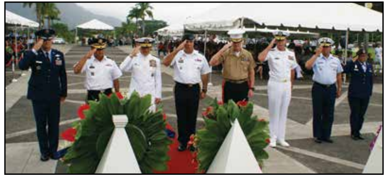
U.S. Military Leaders