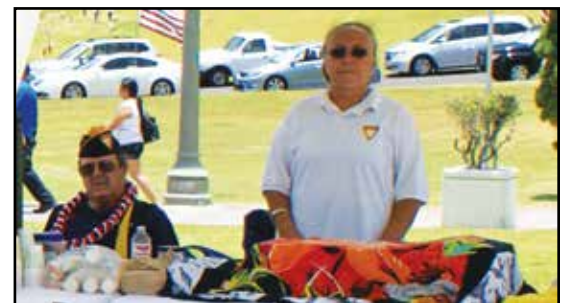
Fleet Reserve Association, Branch & Unit #46