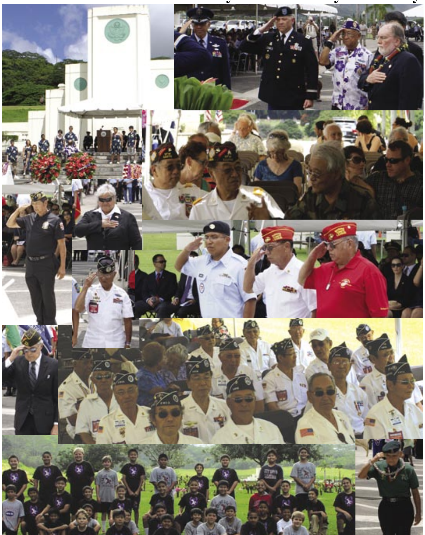
Thank you to the Saint Louis Middle School students for cleaning the cemetery.

Hawaii State Veterans Cemetery Memorial Day Ceremony